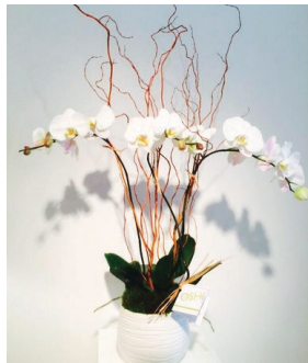
Double Phalaenopsis Plant Composition $90